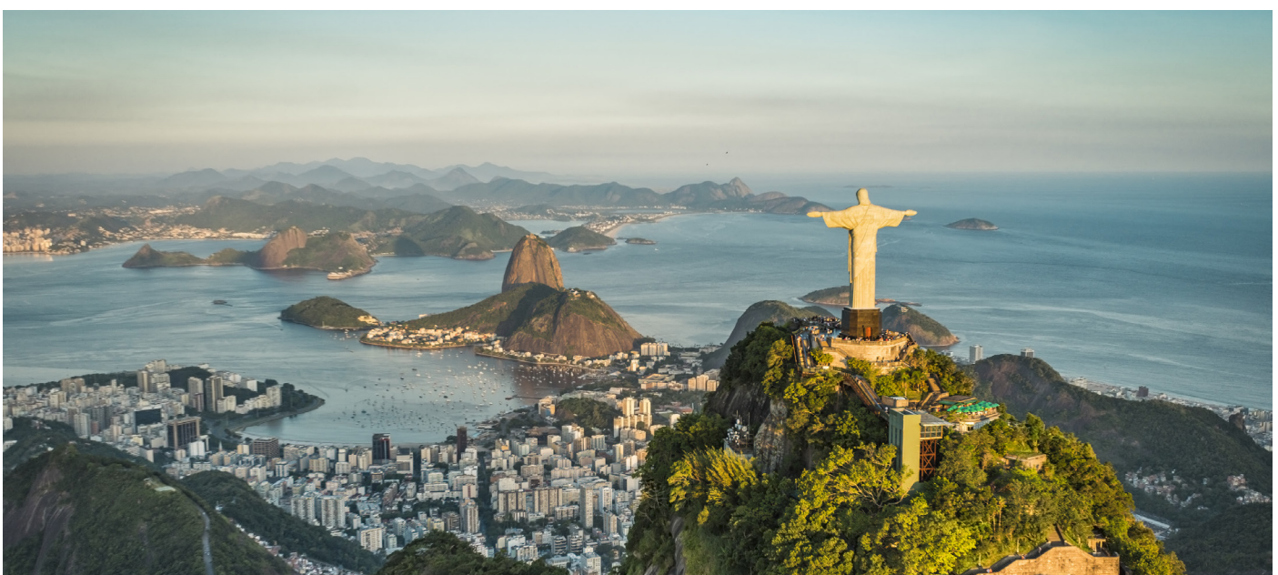
Christ the Redeemer, an astonishing sculpture located at the peak of Corcovado Mountain (Morro do Corcovado) and one of the New Seven Wonders of the World, is the highest point in the city.

RFS’ omnidirectional indoor antenna is designed for modern in-building broadband wireless communications systems that use MIMO technology. Incorporating the antennas in an active distributed antenna system (DAS) solution ensures signal stability.