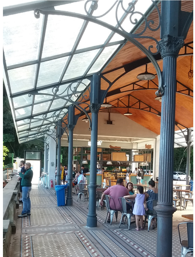
The Paineiras visitor center abounds with local culture and history.